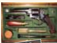
Northern Arms Fair www.northernarmsairs.co.uk